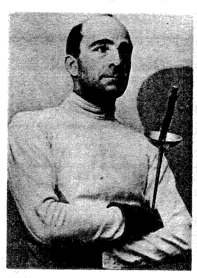
Our First Patron

At least $8,000 must be collected before our next issue in April. Besides your own contribution we enlist your active solicitation of friends and business acquaintances.